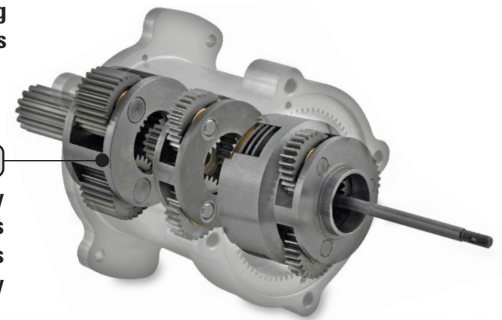
PRODUCTION Assembly Bearings Milled Housing with Internal Gears Planetary Gear Assembly